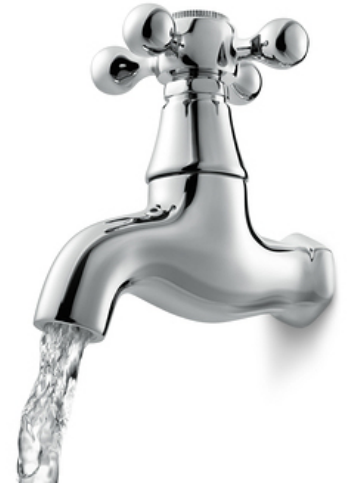
World Health Organization Data: Tooth Decay Trends For Children in Fluoridated Versus Non-Fluoridated Countries*

References at: https://fluoridealert.org/content/fluoridation-ineffectiveness-2024/