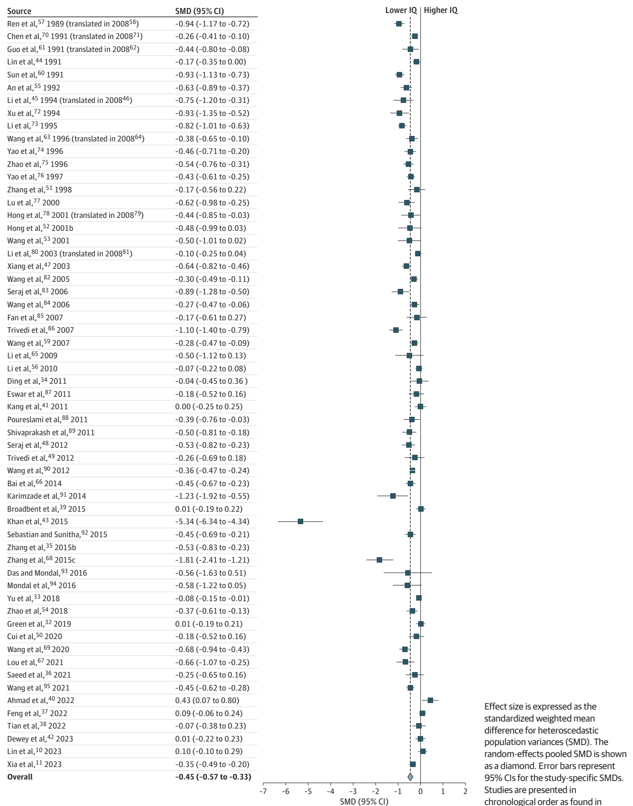
Figure 1. Forest Plot for Random-Effects Meta-Analysis of Standardized Mean Differences (SMDs) of the Association Between Group-Level Measures of Fluoride Exposure and IQ Scores in Children