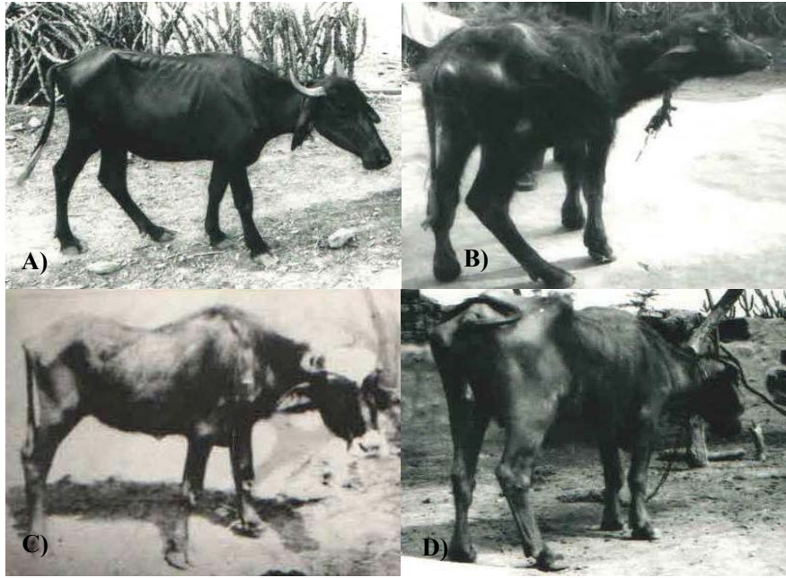
Figure 4 Buffaloes (calves, juvenile and old buffaloes) afflicted with severe skeletal fluorosis characterised with lameness and/or ankylosis in hind legs, enlarged joints, debility, invalidism, hoof deformities, stunted growth, wasting of body muscles and bony lesions in the mandibles, ribs, metacarpus and metatarsus regions.

fluoride [58]. Interesting, among these animals, immature animals were found to be revealed the earliest sign of chronic fluoride poisoning, dental fluorosis. Among these animals, bovine calves are, however, better bio-indicators for fluorosis compared to lames and kids. Findings this study also revealed that buffalo calves are slightly better bio-indicator than cattle calves for the evidence of endemic fluorosis. However, more survey studies are needed to confirm this fine difference.