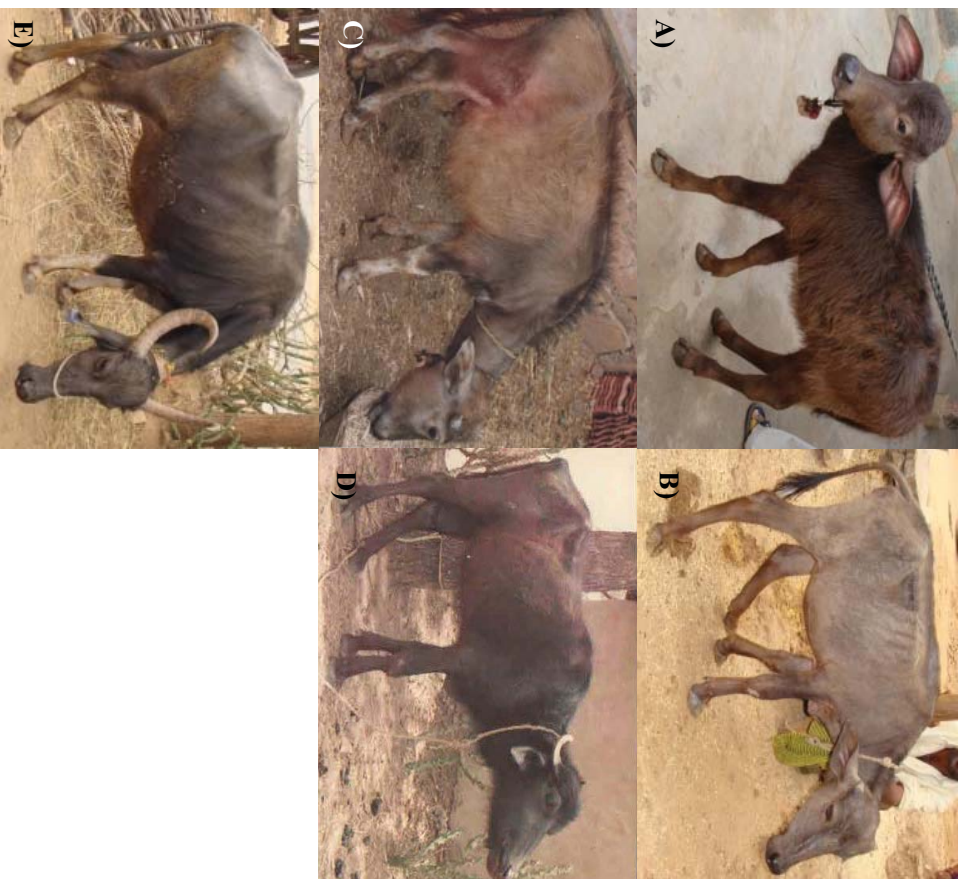
Figure 3 Buffaloes (calves, juvenile and old buffaloes) afflicted with mild to moderate skeletal fluorosis. A calf < 2 months (Figure 3A) had dental fluorosis. (Figure 2A). Remaining buffaloes had also dental fluorosis. They usually seem physically normal when viewed from a distance, but they are quite lethargic. They take time to get up and sit and have a lot of difficulty. They often move slowly and intermittently and have mild lameness in their back legs.

in hydrofluorosis, the staining of teeth is more deep and regular, whereas in industrial fluorosis it is light or diffuse and mostly irregular in appearance.