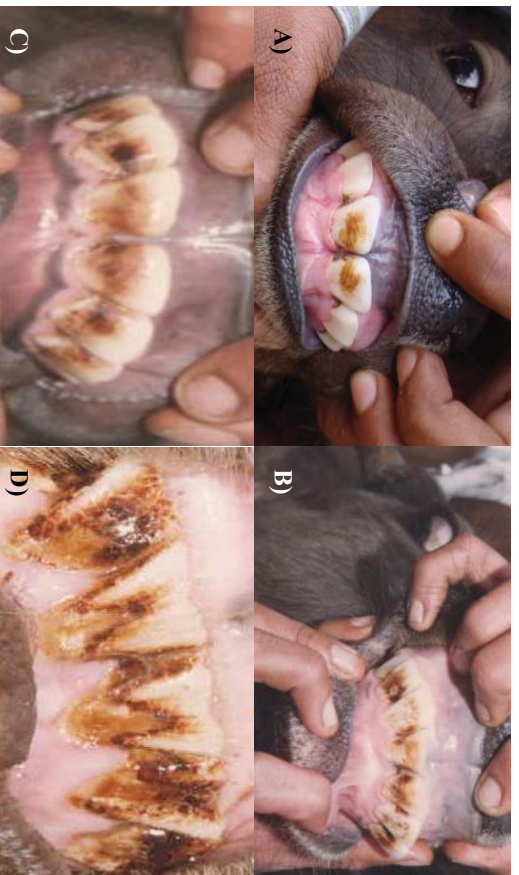
Figure 2 Buffaloes afflicted with moderate to severe dental fluorosis characterised with bilateral, striated, deep brownish staining in calf below two month age (Figure A), juveniles (Figures B and C) and adult buffalo (Figure D). In adult buffalo, excess wearing of teeth and recession of gum indicate severe dental fluorosis.