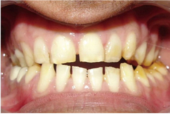
Figure 1 Baseline pre-treatment intraoral photograph.

This article documents a case of severe dental fluorosis with intraoral findings such as severe attrition, anterior open bite and unilateral cross bite, which was treated by full occlusal rehabilitation. Novel clinical and technical modifications were employed which may help to simplify the procedure of full occlusal rehabilitation.